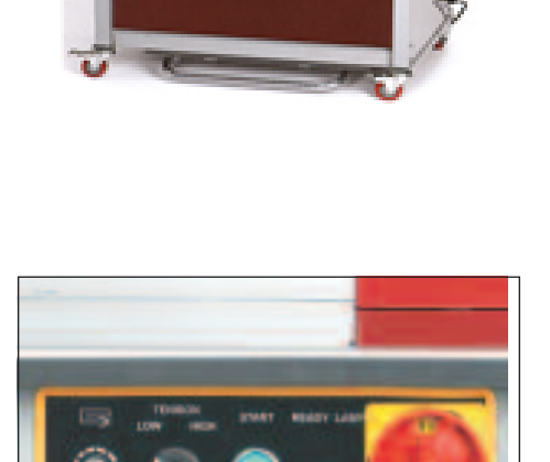
OPERATOR FRIENDLY RECESSED CONTROL PANEL