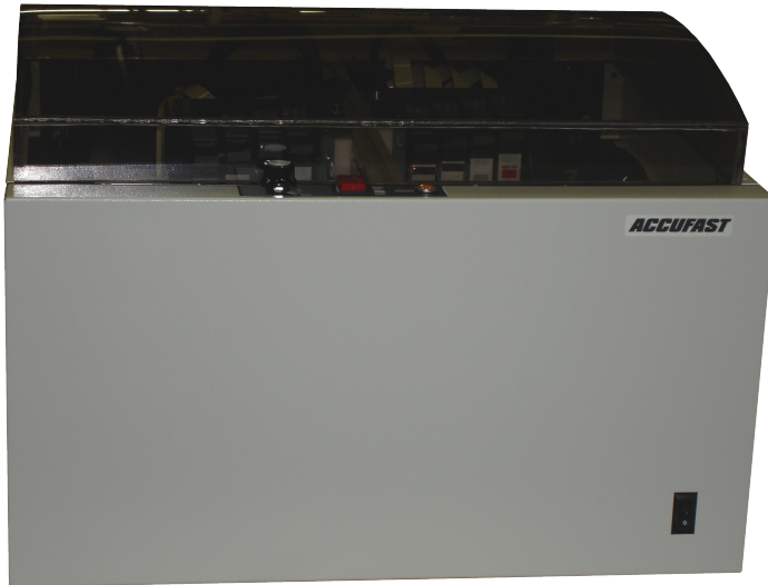
ACCUFAST P8 Print Module

ACCUFAST listened to our customers and created a successor to the P6 - the 6 pen ink jet that started it all. Introducing the ACCUFAST P8 table top ink jet print module.