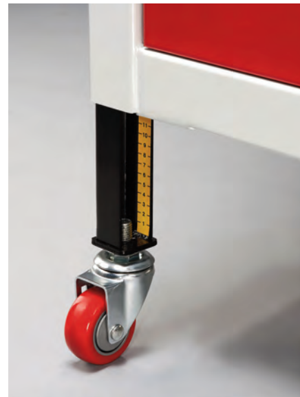
Adjustable table height