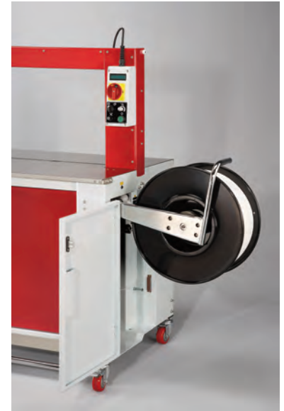
Easy coil leading system