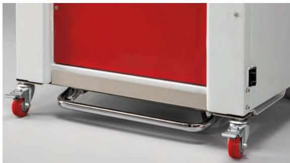
Foot bar activation