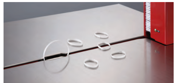
Jam free technology

(technical specifications continued on reverse side)