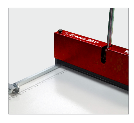
SIDE ADJUSTMENT Side adjustment wheels for quick exchange of paper position.