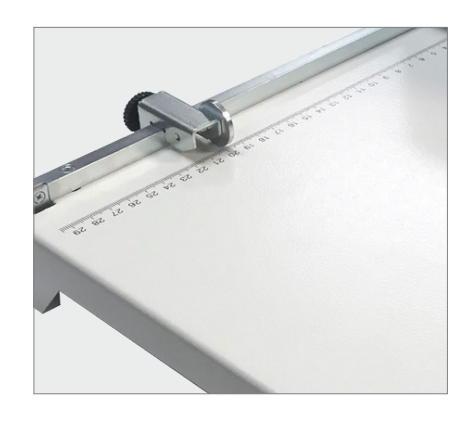
SIDE GUIDE Side guide with skew adjustment for ease of use.