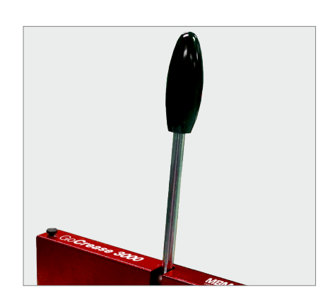
ERGONOMIC BAR Ergonomic bar for easy creasing with minimum use of force.