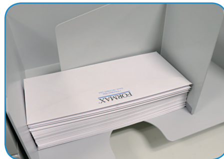
Adjustable outfeed tray accommodates a wide variety of envelope sizes, keeping them neatly stacked after sealing