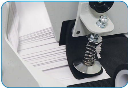
Envelope separator ensures single feeding

Options: FD 430-10 Extended Sealing Kit for flaps up to 4" long, FD 430-20 Square Flap Moistening Basin and Roller