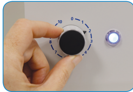
Variable speed control knob