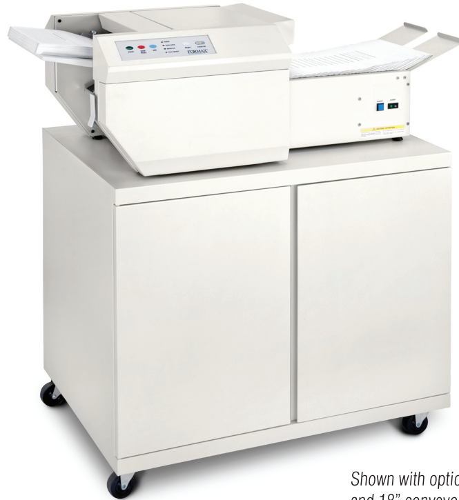
Shown with optional cabinet and 18" conveyor

The FD 2030 AutoSeal ® desktop pressure sealer provides a reliable and compact solution for processing pressure sensitive self-mailers. Standard features include a six-digit counter, jog control, fault detection, LED indicators and an operator friendly touch-pad control panel. Up to 250 forms can be loaded in the feeder and processed at speeds up to 9,000 forms per hour. All of these features make the FD 2030 the perfect solution for streamlining your post processing. The FD 2030 also has an optional fully enclosed cabinet for storage, and a choice of two conveyors with photo-eye for neat and sequential stacking of processed forms.