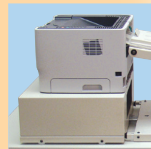
FD 2000-45IL Riser with HP/Troy P2015 Printer

** Dimensions include IL Pressure Sealer and IL Alignment Base (both included) and laser printer (not included in system)