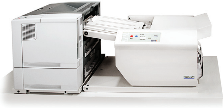
FD 2000IL System shown with IL Pressure Sealer and IL Alignment Base, laser printer (not included), optional conveyor and optional locking cabinets