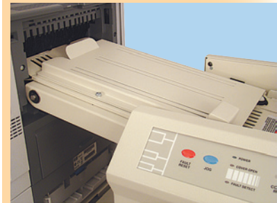
Enclosed paper path provides optimal document security