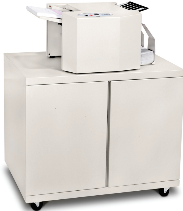
Shown with optional cabinet

The FD 1500 AutoSeal ® is The low volume folder/sealer solution for processing one-piece pressure sensitive mailers. Built with proven Formax technology, the FD 1500 provides an economical solution with the quality and reliability you have come to expect from Formax. The sleek office design and ease of operation makes this unit ideal for processing documents in an office environment with low volume applications. A processing speed of up to 85 forms per minute enables operators to complete daily jobs with ease. The added capability of processing 14" forms gives the FD 1500 the versatility needed to fold and seal virtually any low volume application to meet your needs.