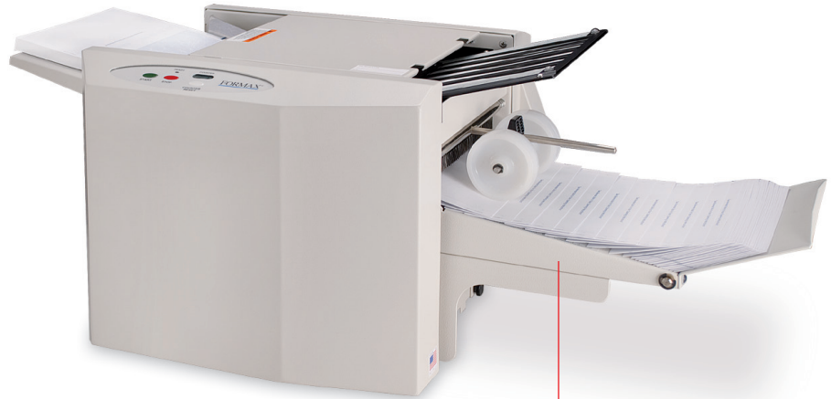
Integrated Output Conveyor