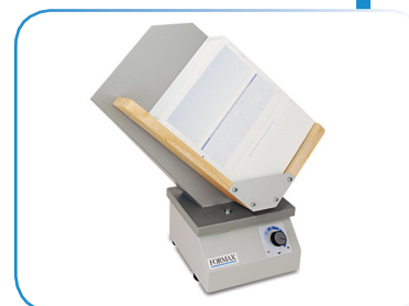
402 Series Jogger - an option which reduces static electricity from forms and aligns them for proper feeding

The FD 1500 Plus is designed for user-friendly operation. Simply set your folds according to the clearly marked settings on the fold plates, load your forms using the drop-in feed system, press start and you're on your way. The FD 1500 Plus has LED indicators for power on, fault detection, paper out and cover open. It also includes a six-digit counter for audit control and an integrated output conveyor.