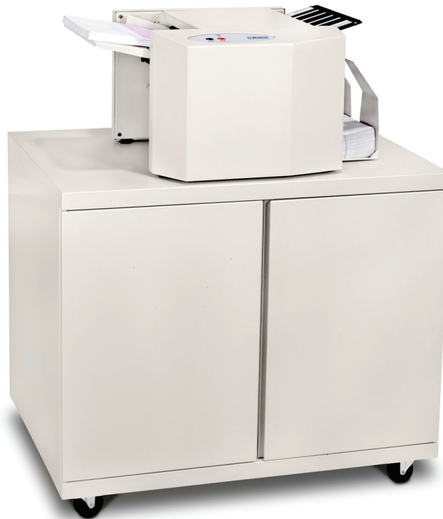
Shown with optional cabinet

The FD 1400 AutoSeal® offers a user-friendly low-volume solution for processing one-piece pressure sensitive mailers. The clearly marked fold plates, control panel, and drop-in feed system provide easy set-up and operation, right out of the box. These features, combined with a sleek desktop design, make the FD 1400 ideal for processing documents in an office environment with low volume applications. With a speed of up to 60 forms per minute and the added capability of processing 14" forms, the FD 1400 enables operators to complete daily processing jobs with ease.