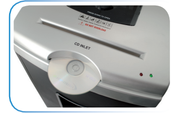
Dedicated CD infeed slot