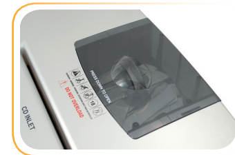
Dedicated CD waste bin, separate from paper shreds