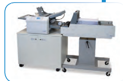
FD 38X in-line with optional V-Stack36 Vertical Stacker, stand and cabinet