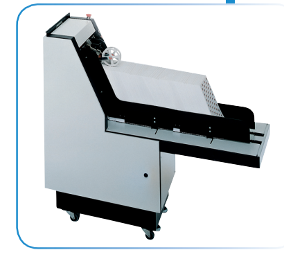
FD 2000-60 Bulk Input Loader (optional)