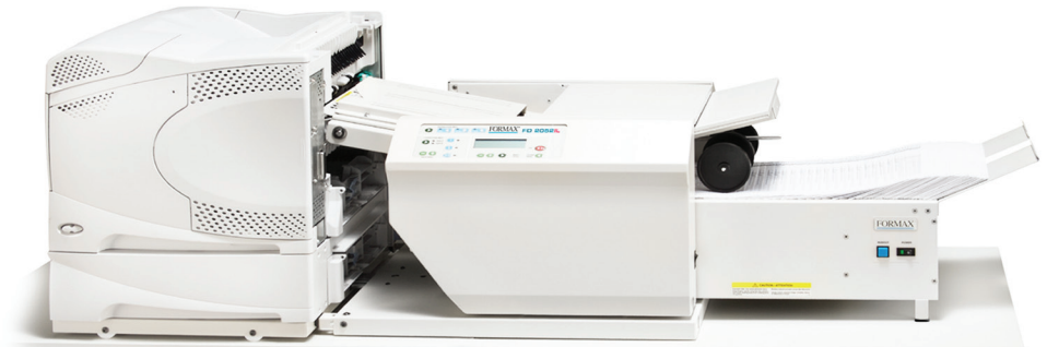
FD 2052IL System shown with IL Pressure Sealer and IL Alignment Base, laser printer (not included), optional conveyor and optional locking cabinets