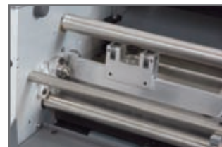
RAC Compression Crease