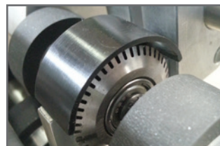
Rotary Perforating Standard

One easy-to-use machine to meet all your creasing, perforating and numbering needs.