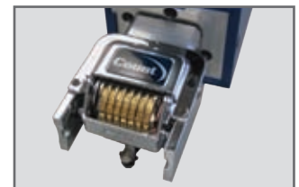
Numbering Head Wheel With Font Style Gothic (7)

With the investment in a single machine, you can handle high quality perforating, creasing and numbering all-in-one. The COUNT FC114 is available with reliable friction paper feed, or choose the FC114A bottom air-feed machine. Both deliver accurate rotary-actuated creasing with 2 crease widths, pneumatic numbering up to 24 times per sheet virtually anywhere on the sheet, plus perforation and optional micro-perfing. It's a compact, incredibly easy to use and highly versatile "all in one" solution that includes automatic "one-touch" set-ups.