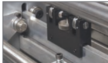
Rotary Actuated Impact Creaser

Get the features and speed you need, in an easy-to-use, affordable machine.