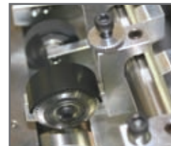
Rotary Perf and Score