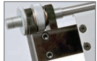
Micro Lateral Adjust

The COUNT™ EZCreaser gives you the robust features you need at an economical price, for lower to medium volume creasing, scoring and perforating. You get the speed and reliability of a top-feed automatic friction paper feeder, with smooth, consistent operation. You get a machine that's simple to set up, and easy for anyone to use with the popular COUNT touch-screen operation, and one-touch automatic set-ups built in. And you get even higher speeds for operating in perf mode, with 5 interchangeable perf options (including micro-perf).