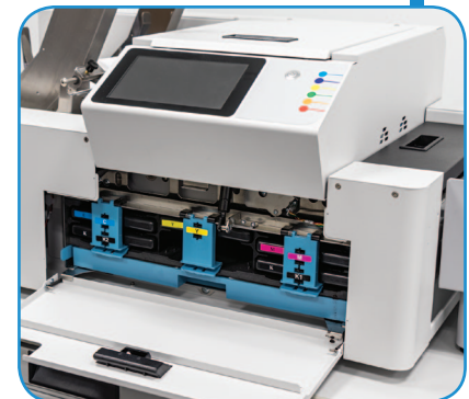
Clamsell design offers easy front access to ink tanks and paper path