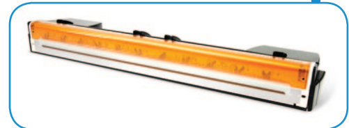
Memjet® print head has 70,400 ink nozzles for higher speeds, lower ink use and less noise than standard print heads