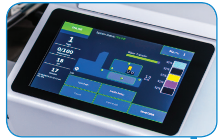
Intuitive 7" color touchscreen displays system status, image preview, and provides access to stored jobs