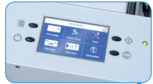
User-friendly color touchscreen