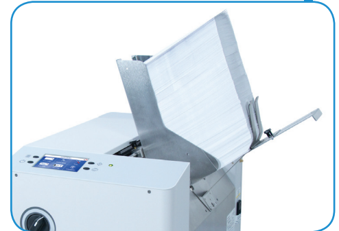
Integrated feeder holds up to 500 envelopes