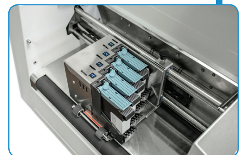
4-pen stitched single-head design